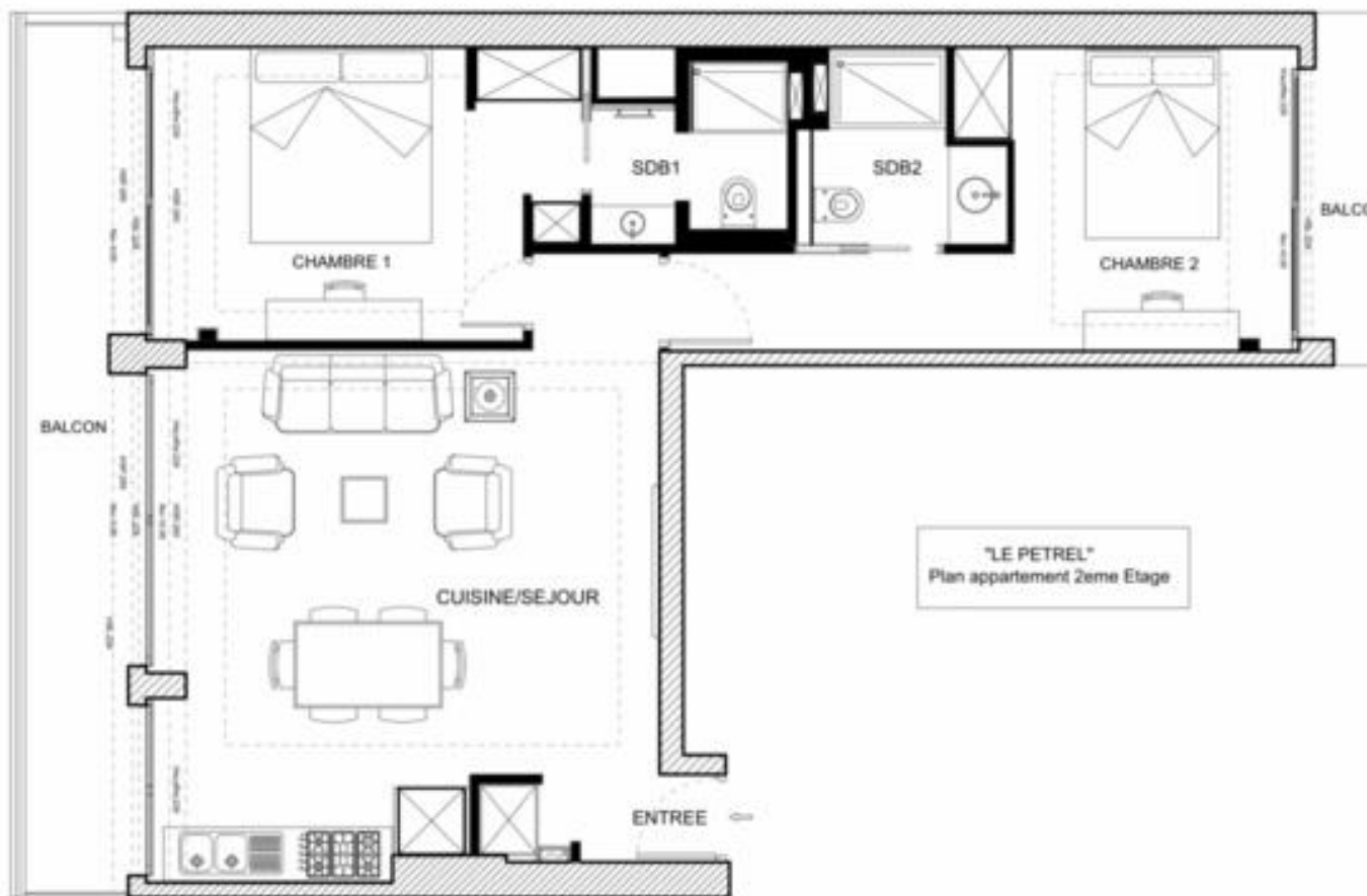
"LE PETREL" Plan appartement 2eme Etage