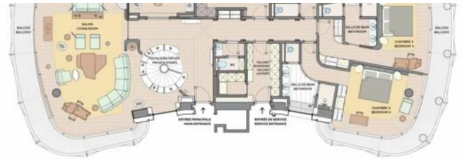
Master bedroom floor :