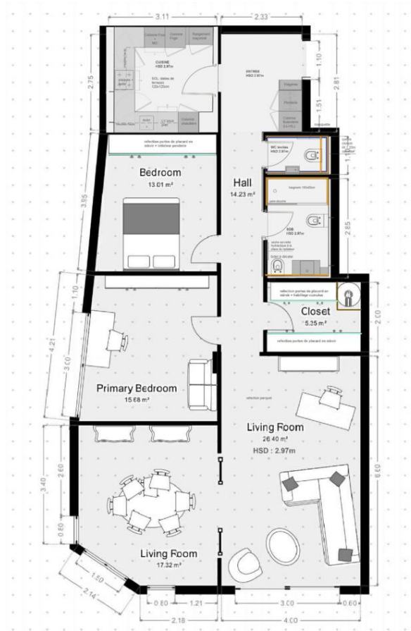
LE SANTA MONICA - Plan

Emma Ruspantini Tél : +377 6 40 61 13 70/+377 93 50 54 64 emma@continentale.mc www.continentale.mc