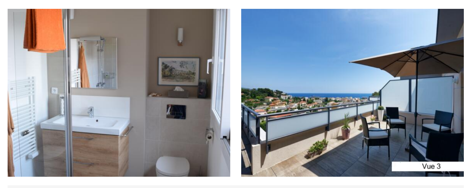
Diagnostique de Performances Énergétiques

Julie Folques Tél : +33 6 32 93 54 23/+377 97 98 15 49 julie@exclusive-estate.mc www.exclusive-estate.mc