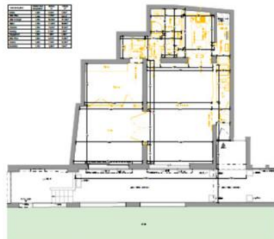
PC07_NV_R+1 - Plan État des Lieux / Démolition Scale: 1/50