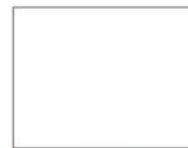
Photographie État des Lieux / Plans Plan de Situation