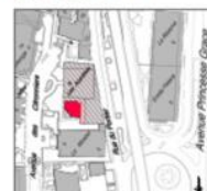
PC02_SITU - Plan de situation