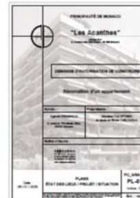
Légende à démolir à conserver