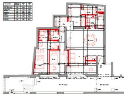
PC07_NV_R+1 - Plan État Projeté Scale: 1/50