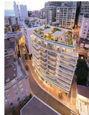
Plans, images, textes et surfaces non contractuels.