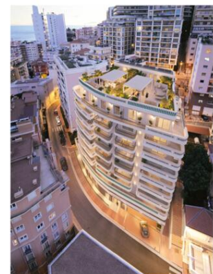
Plans, images, textes et surfaces non contractuels.

MAÎTRE D'OUVRAGE SCI NETTANI Représentée par Monsieur Eric SEGOND GRUPE SEGOND PROMOTION 45 Rue Grimaldi - 98 000 Monaco - Tél: +377 92 05 35 77