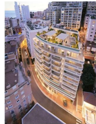
Plans, images, textes et surfaces non contractuels.