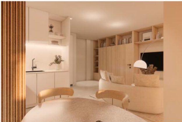
CUISINE + SA MANGER