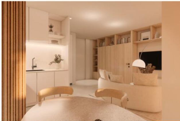
CUISINE + SA MANGER