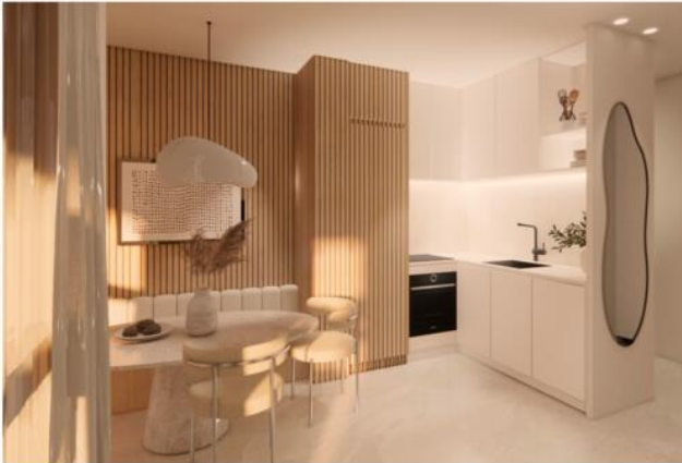
CUISINE + S MANGER