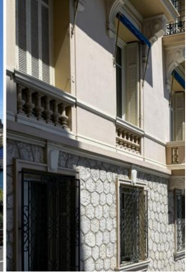
Avenue de la Costa